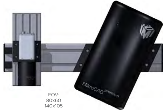
FOV: 80x60 140x105